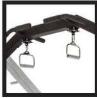
▶ Swivle handle chin-up option