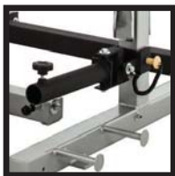
▶ Land mine option for fulcrum lifts: