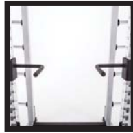
▶ Dip Attachment option